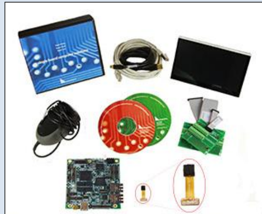
DKV1656 Contents: SBC1656, MIPI CSI camera, sample software, display, cables, and breakout assemblies